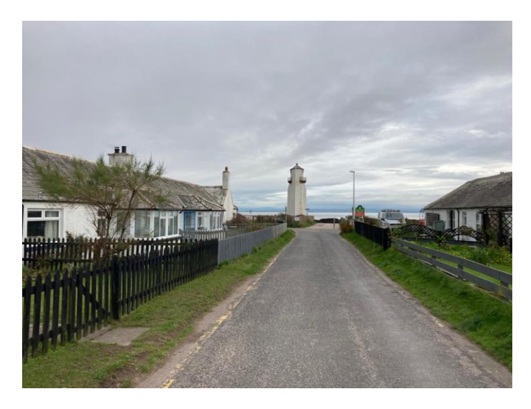
Southerness lighthouse, commissioned in 1748 and improved under the guidance of Robert Stevenson in 1805

Our next stop was the old lighthouse at Southerness Point, from where we could see hundreds, if not thousands of Oystercatchers and numerous Curlews and Redshanks, but as the tide was a long way out, the birds were quite distant.