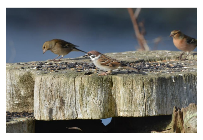
Tree Sparrows are always a welcome sight these days

From here, we drove to the RSPB's Mersehead reserve, where we first went into the viewing room, from where we were treated to excellent views of Tree and House Sparrows, Goldfinches, Greenfinches, Robins and Dunnocks on and below the feeders, as well as two Coal Tits. Out on the marsh beyond the pools a large flock of Barnacle and Canada Geese could be seen foraging in the grass, and a number of Starlings were also seen, looking surprisingly striking at such close quarters.