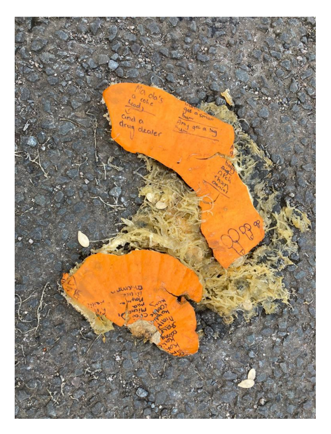
"Pumpkin porn", which we came across in more than one location – a bizarre Galloway tradition?

By now the afternoon was drawing to a close, so we started our journey back to Kirkcudbright, stopping briefly in the Castle Kennedy grounds to admire the beautiful scenery and Lochinsh Castle across the White Loch, where several Great Crested Grebes were to be seen.