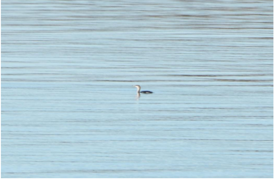
The bay was idyllic, with a Red-throated Diver just offshore